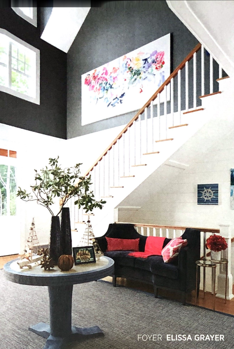
FOYER ELISSA GRAYER