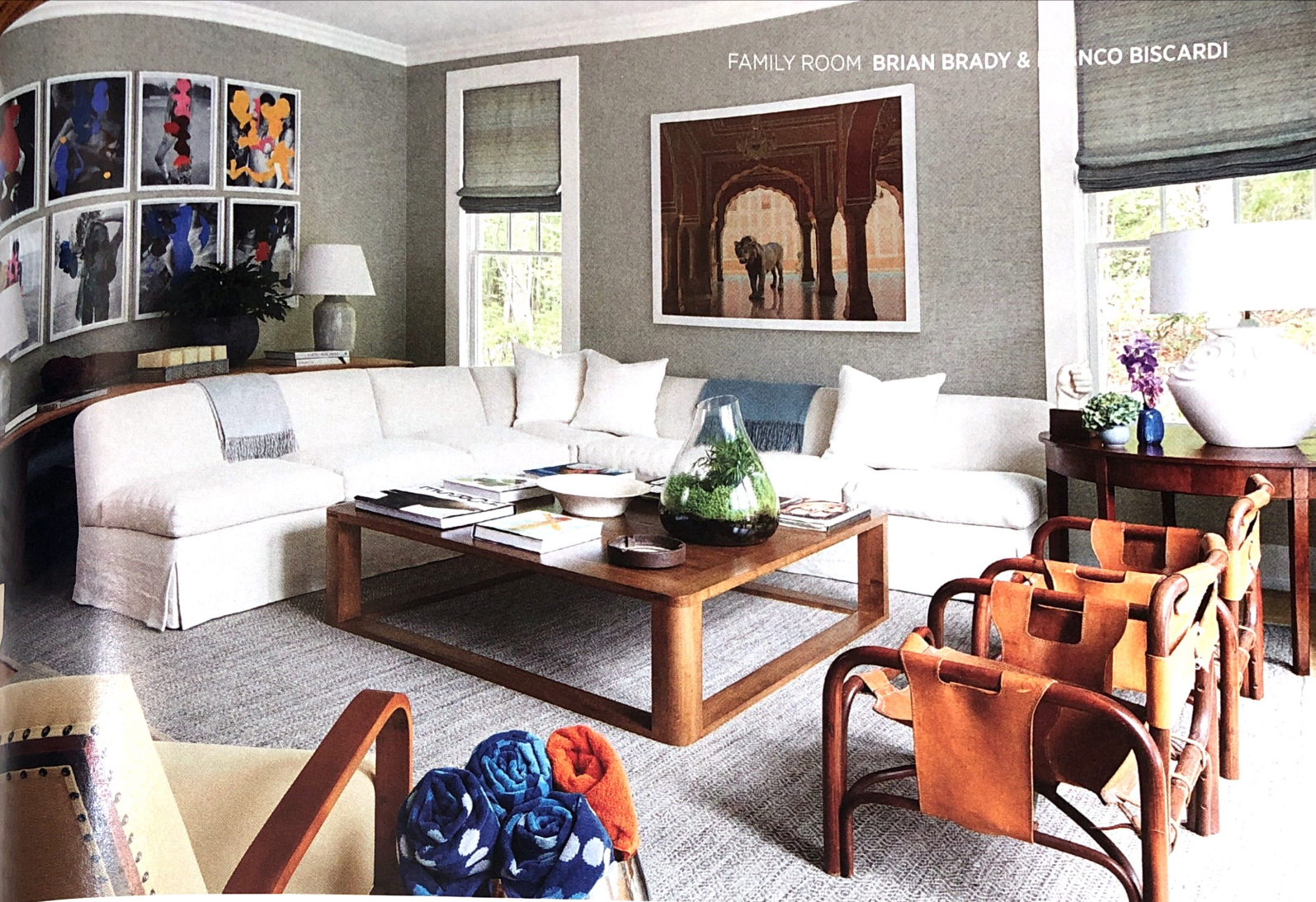
FAMILY ROOM BRIAN BRADY & ENCO BISCARDI