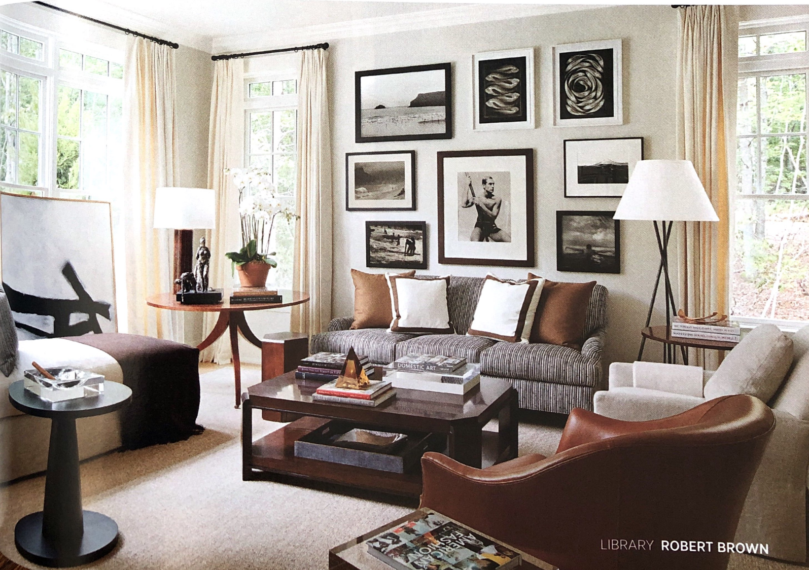
LIBRARY ROBERT BROWN