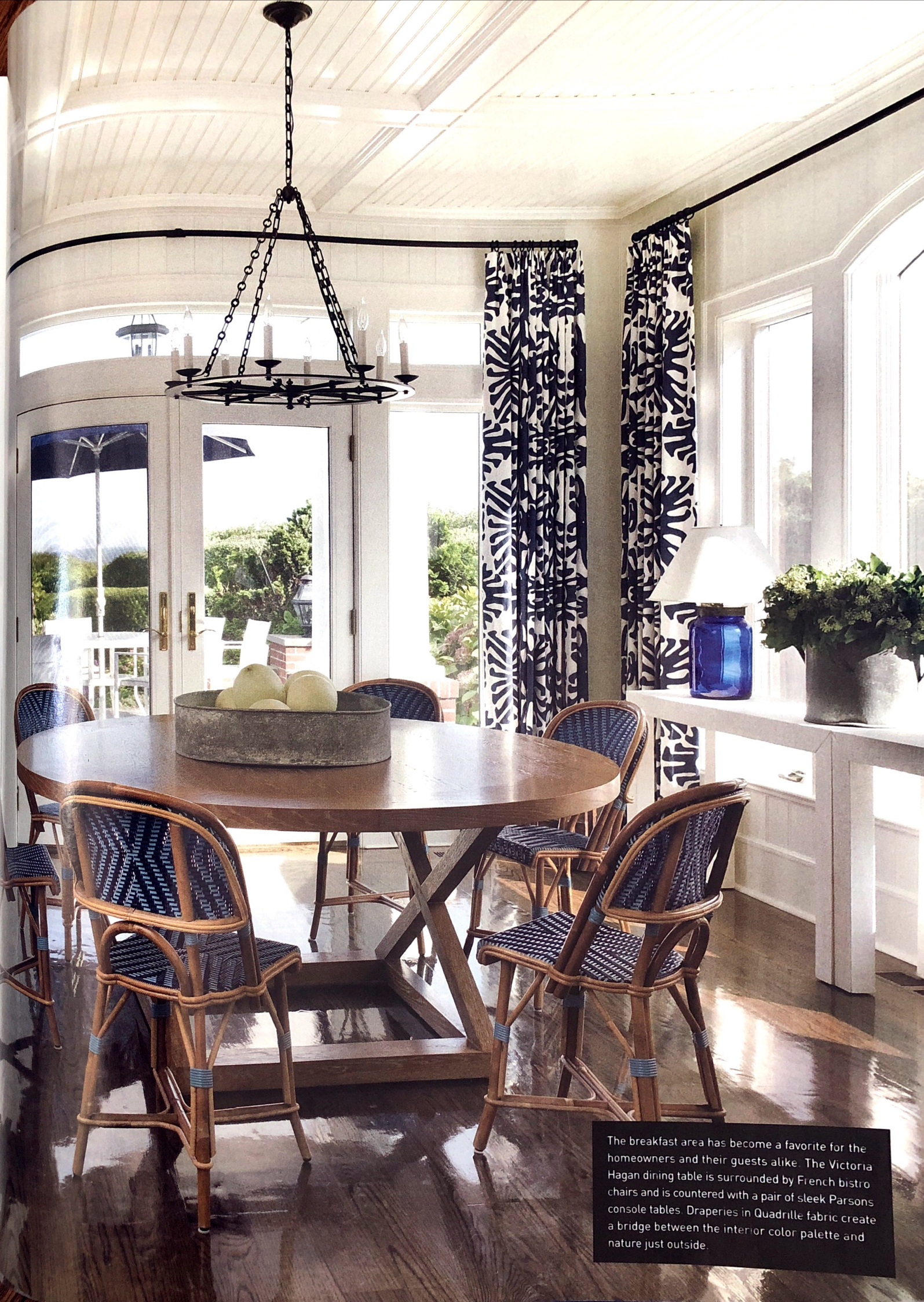
The breakfast area has become a favorite for the homeowners and their guests alike. The Victoria Hagan dining table is surrounded by French bistro chairs and is countered with a pair of sleek Parsons console tables. Draperies in Quadrille fabric create a bridge between the interior color palette and nature just outside.