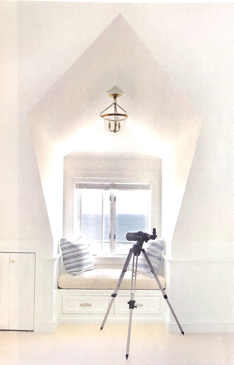
The homeowners' telescope finds the perfect perch beside a cozy window seat in Ralph Lauren's Goldenrod Herringbone fabric in a soft creamy colorway.